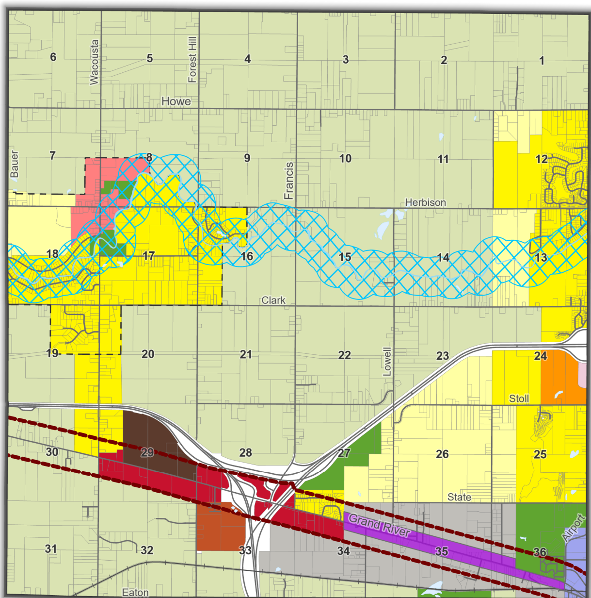
Map 3.2. Watertown Township: 2024 Future Land Use Map

Data Source: FLU: Watertown Roads: Michigan Open Data v17a. Map Exported: January 31, 2024. ©2024 Giffels Webster.